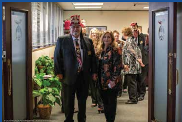
Illustrious Ruben Robles and First Lady Bea